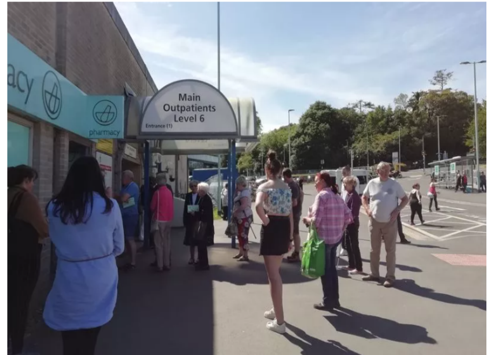
Queue outside Lloyds Pharmacy at Derriford Hospital on May 22